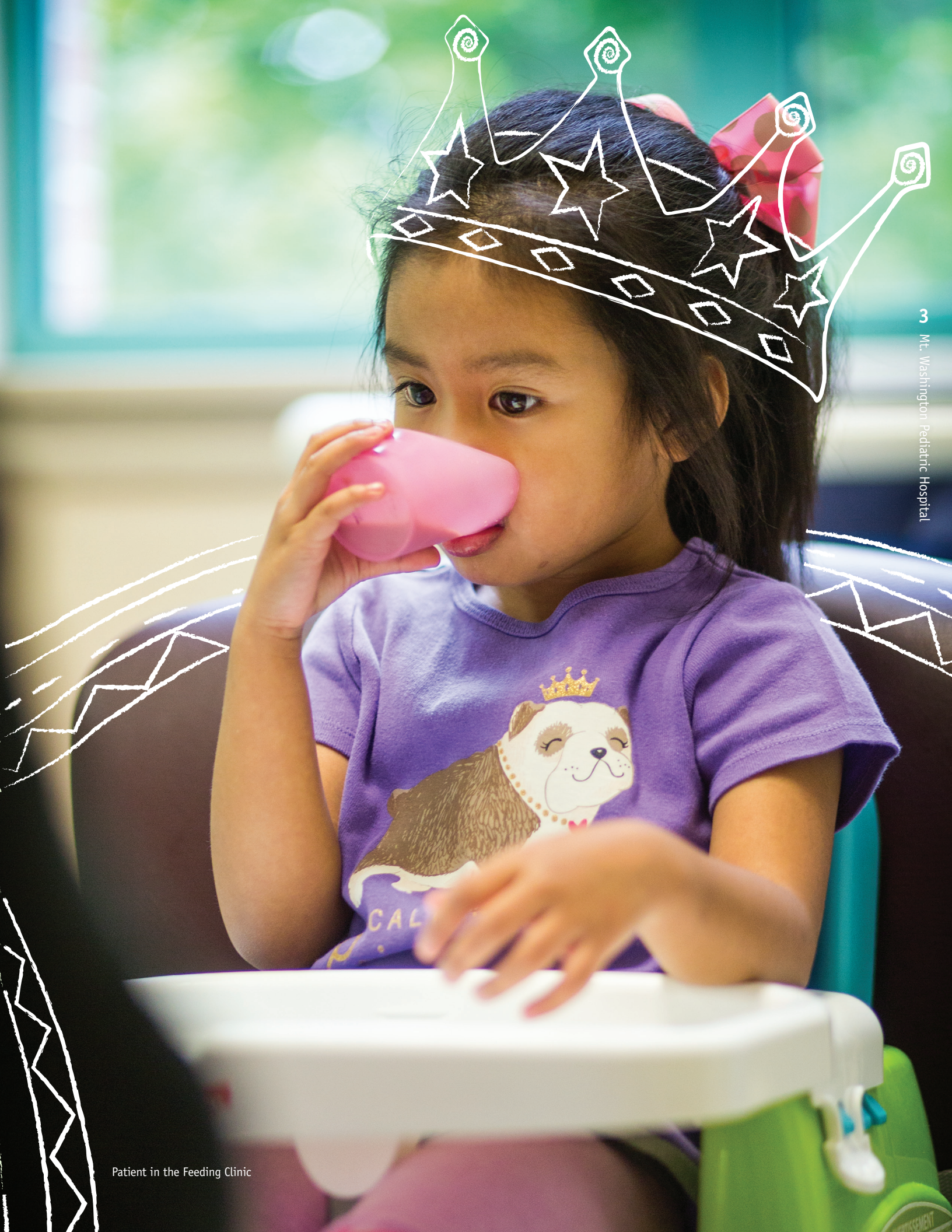
Patient in the Feeding Clinic