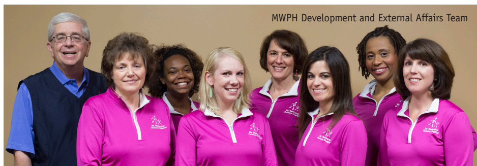
MWPB Development and External Affairs Team